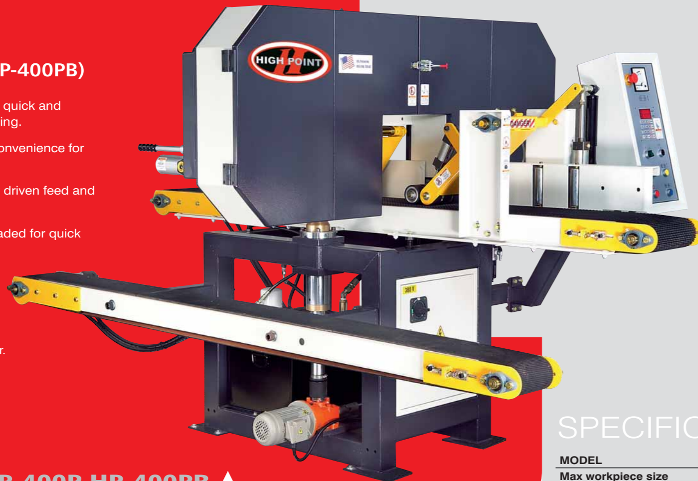
HP-400P, HP-400PB ▲