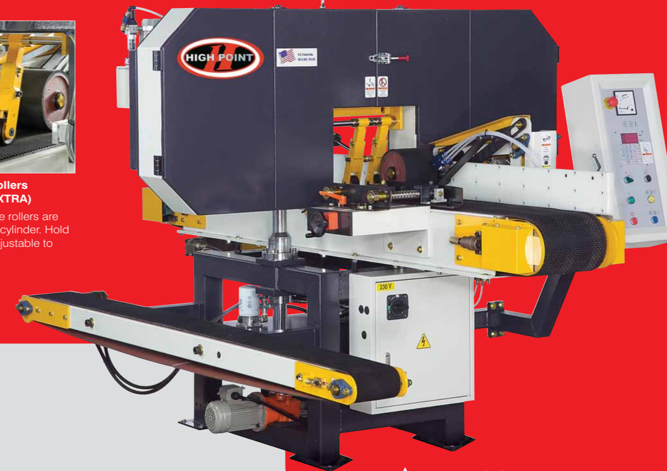
▲ HP-400PB - EXTRA