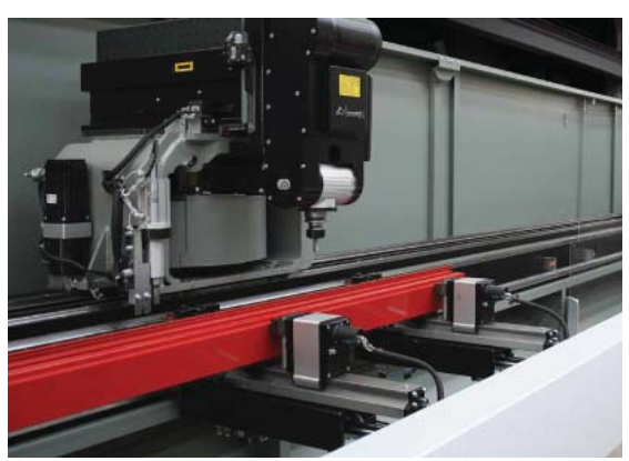
Automatic & precise clamping system