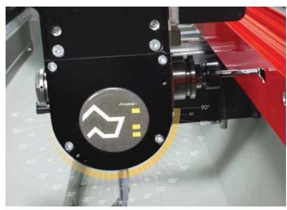
4th axis spindle with continuous movement from 0° to 180°