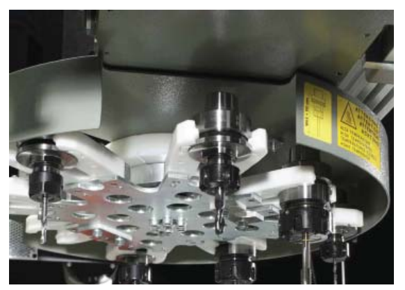
4 or 8 slot round tool holder offers quick tool changes